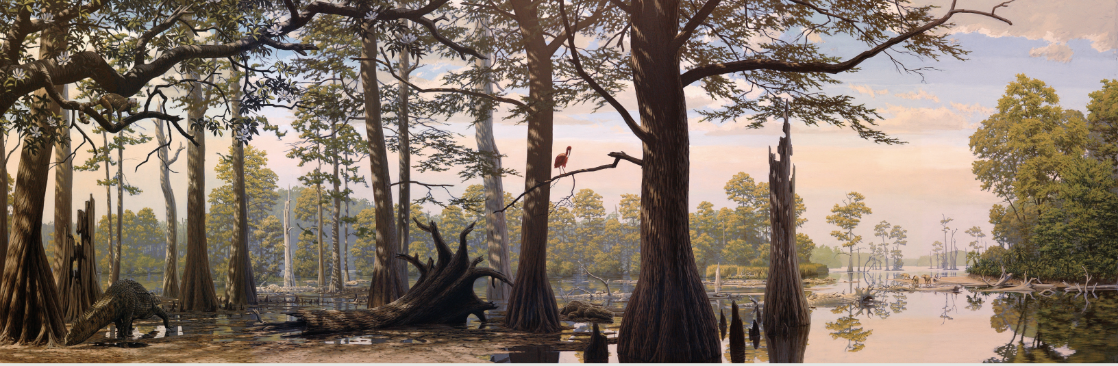
Figure 7. Habitat reconstruction painting of a North Dakota Paleocene swamp. Mural at the North Dakota Heritage Center.

fine resolution (probably within a few hundred thousand years), the age of the site.