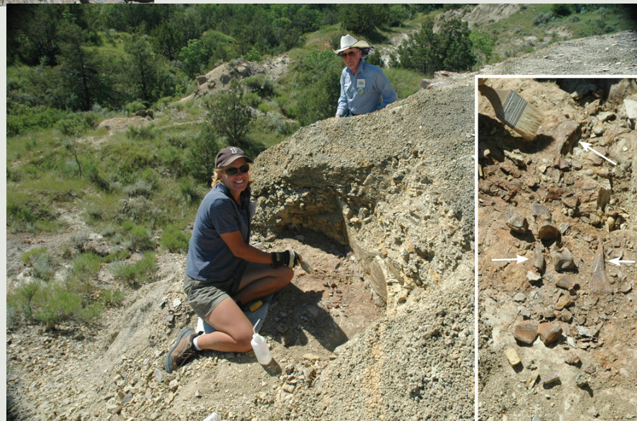
Figure 3. Partial, disarticulated skeleton of Champsosaurus gigas being excavated at the Medora site. Inset: Arrows point to skeletal parts in place within the mudstone.

Fossils of freshwater mussels are abundant at this site and often occur in clusters (fig. 2). The original shell material is preserved, and they are difficult to collect because they are so fragile. At least two species of freshwater snails, including Campeloma , and