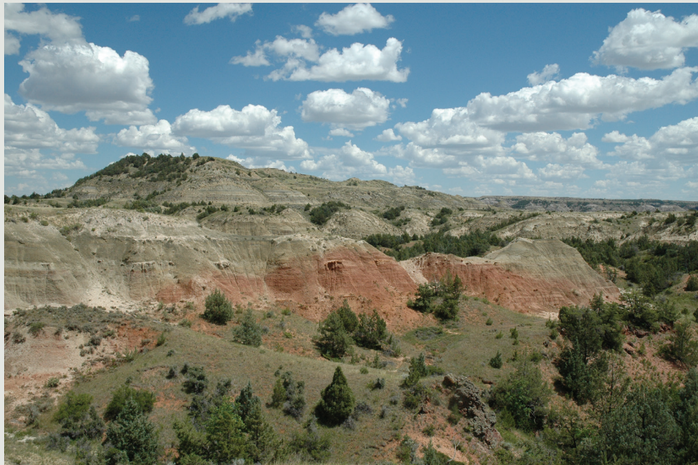
Figure 1. HT Butte clinker (red) overlain by the Sentinel Butte Formation (gray) at the Medora site. Map of North Dakota showing location of the Medora site (red star).

The carbonaceous mudstone is underlain by an indurated, gray mudstone that contains plant fossil debris. The origin of these sediments was primarily from rivers and streams flowing from the west. The thin organic, lignitic layer, where most of the fossils are entombed, is derived from aquatic plants in the swampy environment and leaves, branches, etc. from trees and shrubs growing in and adjacent to the swamp. The bone bed is about 20 feet (6.5 m) above the top of a reddish clinker (HT Butte Bed) that marks the contact between the Bullion Creek and Sentinel Butte Formations (Fort Union Group) (fig. 1). Remains of the bear-like