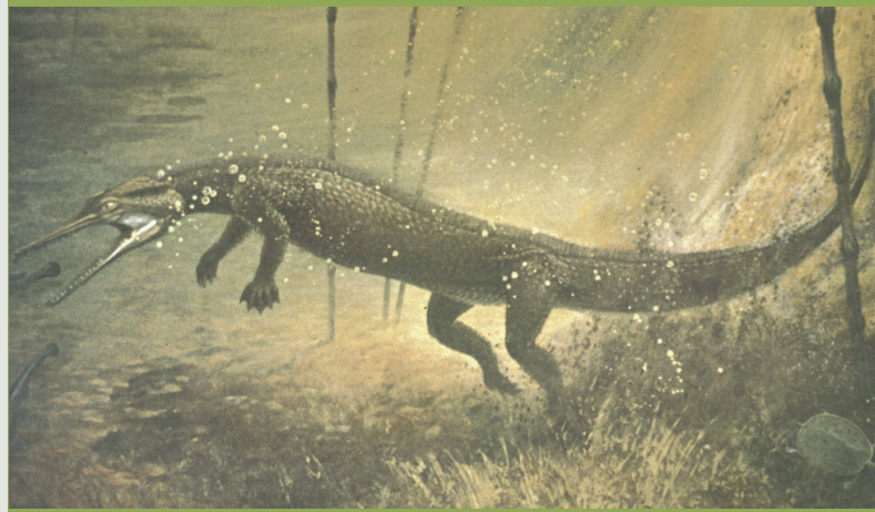
Figure 4. Painting of Champsosaurus gigas by Jerome Connolly, Science Museum of Minnesota, St. Paul.

Recent screen-washing of sediment from the bone bed has yielded numerous small mammal teeth and jaws. Most of the teeth are the size of the head of a pin (or smaller!), but three jaws have been recovered so far, two of them less than half-an-inch (< 1 cm) in length. Small teeth from an extinct group of mammals referred to as multituberculates (which filled the rodent niche) and insectivorous mammal teeth have been identified from the screen-washed matrix. Remains of much larger mammals have also been recovered from the site including toe bones from a black bear-sized animal ( Titanoides ?) and limb bones from a smaller (porcupine- to beaver-sized) mammal. These mammal fossils will help us determine, we hope with very