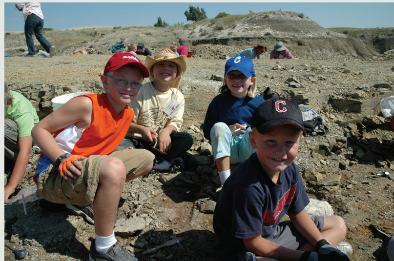
Figure 8. Fossil diggers on family day at the Medora site.

The Medora swamp was a feeding ground for crocodiles and champsosaurs. This is indicated by the disarticulated skeletons, crushed bone, and abundant crocodile coprolites in the site. The champsosaurs were primarily feeding on fish and the crocodiles were feeding on everything they could catch, probably including mammals that wandered too close to the water. Numerous depressions in the bone bed are interpreted to be crocodile footprints, and broken bones found at the site suggest that these large animals trampled and bioturbated the swampy area while scavenging for food. The Medora swamp would have been a putrid, smelly, disgusting place because of the decaying carcasses, rotting flesh, and abundant feces of the animals that fed on them.