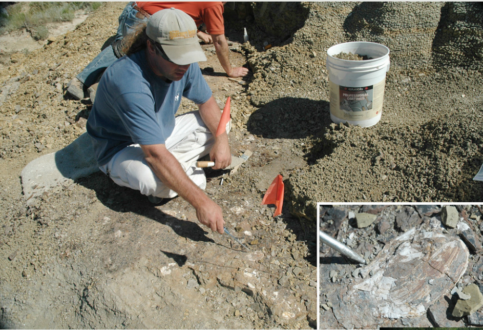
Figure 2. Cluster of freshwater bivalves exposed at the Medora site. Inset: The original shell material is preserved on these 60 million year old clams.

The largest animals we have found fossils of at the Medora site are crocodiles. Hundreds of crocodile teeth have been recovered as well as vertebrae, limb bones, and scutes (bony dermal armor). This Medora wetland existed about 5 million years or so after the extinction