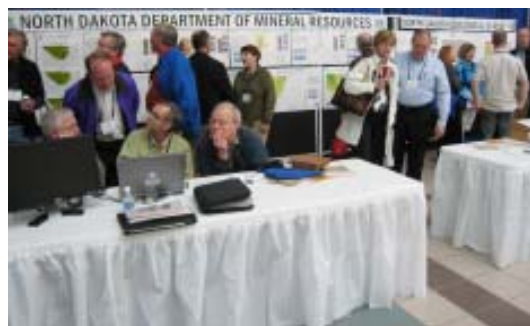
Figure 3. The ND Department of Mineral Resources booth at the 2008 conference. Recently published maps of the Bakken Formation and core of the upper, lower, and middle members of the Bakken Formation were big draws in the DMR booth.

In addition to the Expo, workshops, and traditional activity updates for each of the states and provinces within the Williston Basin, there were 14 other presentations, and two panel discussions: one on pipeline transportation issues and the other on Bakken completion and stimulation. As would be expected, several of the talks focused on the Bakken Formation and were well received. There was also significant interest in other producing horizons such as the Red River Formation that demonstrated a number of companies, for a variety of reasons, are looking beyond the Bakken. The keynote address, entitled Energy Geopolitics , was presented by Michael Economides, a professor of Chemical and Biomolecular Engineering at the University of Houston, and author of a number of books including The Color of Money and From Soviet to Putin and Back .