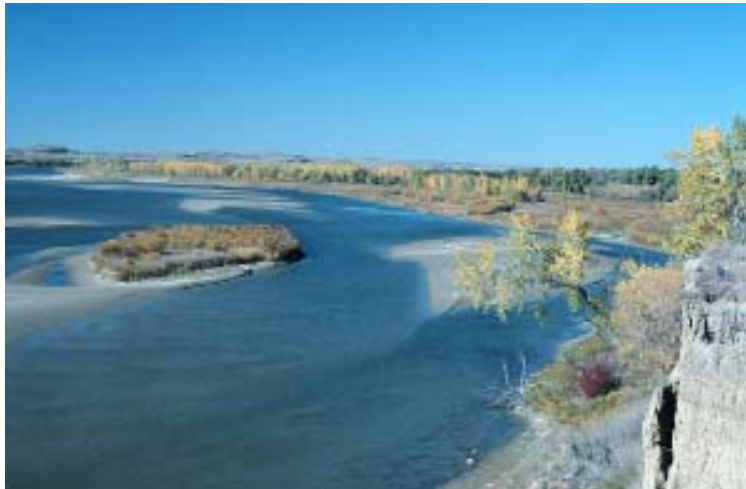
Quaternary terrace along the Missouri River north of Bismarck.