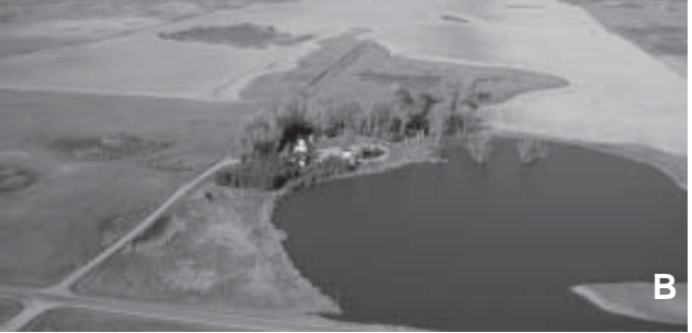
Figure 5. Kite aerial photographs of Devils Heart Butte vicinity. A - view toward the northeast of ice-shoved terrain with Black Tiger Bay in the far background. Devils Heart Butte (DHB) is the conical hill in upper left portion of view. B - northward view with shallow spillway channel marked by small lakes in foreground. Sullys Hill is on the left horizon, and Devils Lake can be seen in the far background.

Kite aerial photographs clearly depict earth-lodge depressions, which are revealed by shadows and distinctive vegetation (fig. 6A). Depressions mark the former interior floors of lodges, which were built at ground level (not dug out). Surrounding each depression is a raised rim composed of material that fell off the lodge wall and roof. Some portions of the site are mowed, so the lodge remains can be seen easily on the ground. Other portions are covered by prairie grass, shrubs and woods. Earth lodges in these unmowed portions are not readily visible from the ground, but are quite evident from above because of variations in vegetation cover.