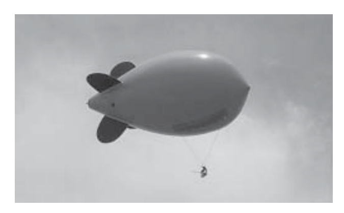
Figure 2. Helium blimp in flight with camera rig suspended underneath. The blimp measures 13 feet (4 m) long and can lift up to 5 pounds payload.

Although wind is a fact of life on the Great Plains, there are occasional days with clear sky and calm air. To deal with such conditions, I recently began using a small helium blimp as the lifting platform for SFAP (fig. 2). The blimp is 13 feet (4 m) long and holds about 250 cubic feet of helium. This gives a payload capability sufficient to lift the same camera rigs that are used with kite aerial photography. The blimp is flown manually with a tether to the ground, and camera rigs are operated via radio control. The blimp provides a stable platform in calm to light-wind conditions (0-10 mph).