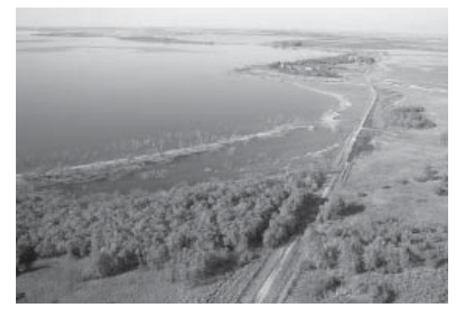
Figure 4. View toward the northwest over the eastern margin of East Devils Lake. Note the old shoreline with dead trees now submerged. A rural road remains barely passable, just above water level.

reputed that Sakakawea came from one of these villages. The remains of hundreds of earth lodges are preserved as circular depressions, each 30-40 feet in diameter. The remains are still quite distinct in spite of former agricultural land use at the site.