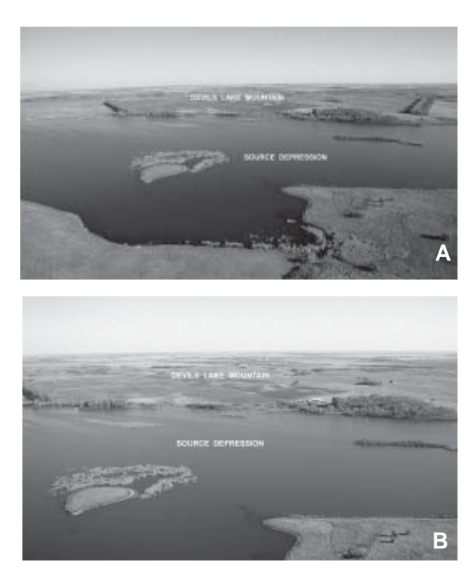
Figure 3. Blimp aerial photographs of Devils Lake Mountain seen from the northwestern side. A - superwide-angle image. Nearly all of the ice-shoved hill and source basin are visible. B - standard, oblique view showing central portion of the hill and source basin.

Knife River Indian Villages National Historical Site is located adjacent to Knife River close to its junction with the Missouri River in central North Dakota. These Hidatsa and Mandan Indian villages were settled beginning around A.D. 1300. Five hundred years later, they figured prominently in the Corps of Discovery, which spent the winter of 1804-05 nearby at Fort Mandan (see NDGS Newletter 26/2). It is