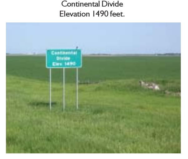
Fig. 1. View of the continental divide from I-94 in eastern North Dakota (photograph by Mark A. Gonzalez).

To the uninitiated eye, the countryside between Valley City and Jamestown is seemingly among the most unremarkable stretches of Interstate 94 (I-94), not just in North Dakota, but along its entire route from Chicago to Seattle. Granted, the terrain here is pretty flat with gentle undulations amounting to less relief than one finds on the waves of the open ocean. And yes, some travelers battle with insomnia in this stretch where the view cannot seem plainer (nor more planar), although the Red River Valley is arguably plainer and indisputably more planar. And just when the landscape cannot seem any more unremarkable, a highway sign proclaims in oxymoronic fashion (Fig. 1):