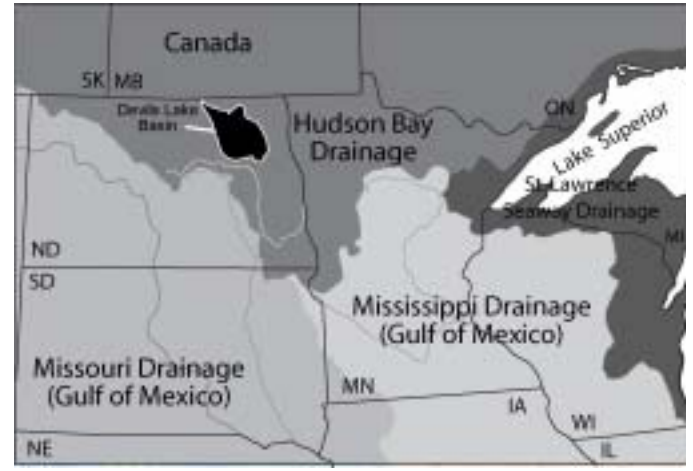
Fig. 4. Map of the interior of North America illustrating the continental divides and major drainage basins of the area.

Many people have argued that the crest of the Appalachian Mountains is also a continental divide, commonly referred to as the Eastern Divide. The Eastern Divide does separate eastward flowing streams, which cross the Piedmont and Coastal Plain and empty into the Atlantic Ocean, from