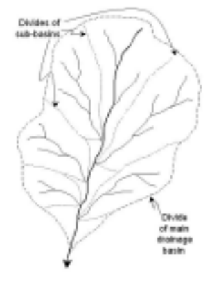
Fig. 2. Schematic diagram showing a drainage divide, the boundary of a drainage basin.

The term "continental divide" refers to a particular type of drainage divide. Unfortunately, various references provide different definitions for continental divide. Consequently, there