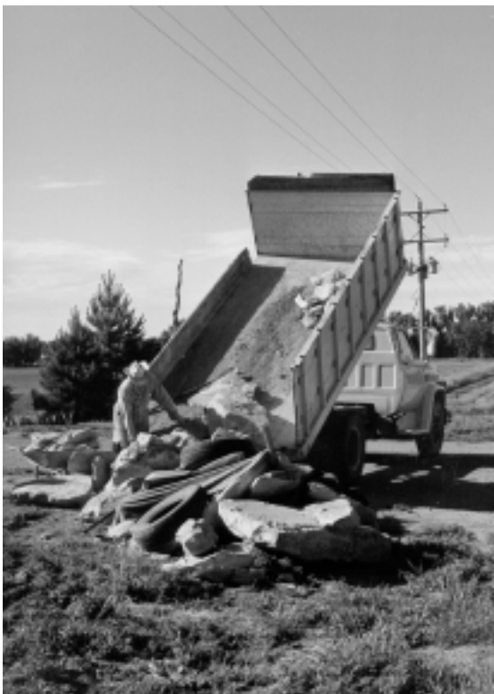
Figure 1. Clarence Johnsrud unloading slabs of leaf-fossil bearing rocks collected from the Sentinel Butte Formation Trenton Hill fossil site.

Clarence contacted me in 1989 about this important site and donated many leaf fossil specimens to the North Dakota State Fossil Collection. Many specimens were exhibited at the North Dakota Heritage Center in Bismarck in a North Dakota fossil exhibit in 1991 and 1992. An unusually well preserved, spectacular Platanus (sycamore) leaf has been on exhibit in the main gallery of the Heritage Center since that time (Figure 4 and 5a). Over 750,000 people have enjoyed seeing it. Clarence has also donated a collection of plant fossils to the University of North Dakota where they are on display in the museum area of