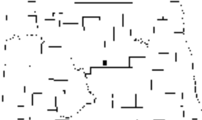
Goodrich West Quadrangle, North Dakota