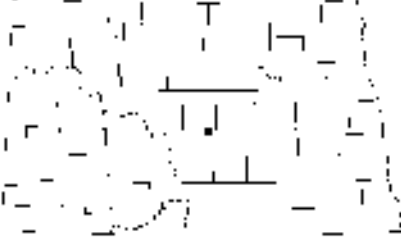
Goodrich SW Quadrangle, North Dakota