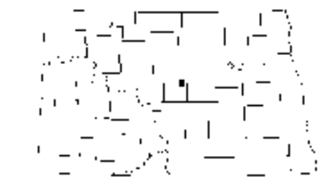
Sheyenne Lake Quadrangle, North Dakota