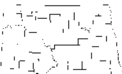
Pretty Rock Butte SE Quadrangle, North Dakota

Scale 1:24,000 0 0.5 1 Miles Lambert Conformal Conic Projection Standard Parallels 46° 00' 00" and 46° 07' 30" 1927 North American Datum NGVD 1929 USGS 7.5 Minute Topographic Map - Contour Interval 20 Feet