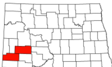
Locations where fossils have been found