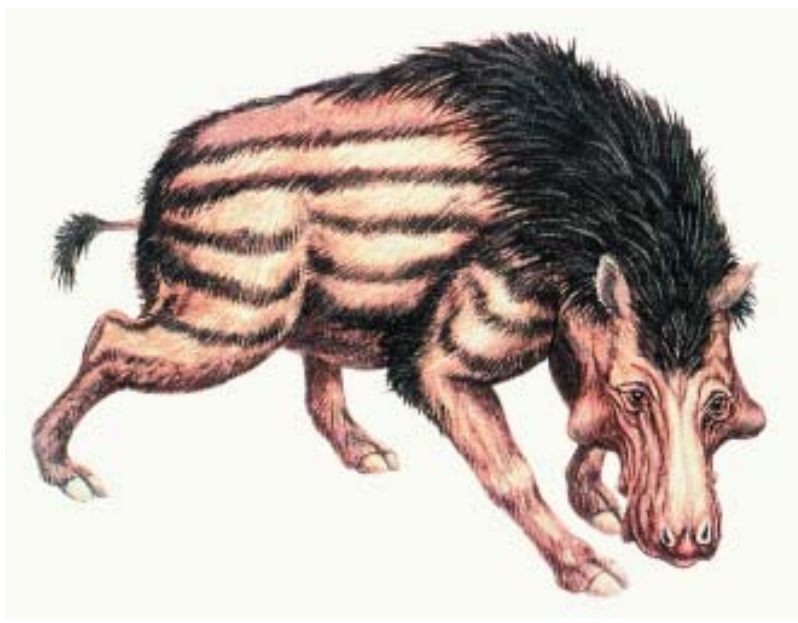
Archaeotherium . Painting courtesy of Simon and Schuster Publishing Company.

Archaeotherium was similar in appearance to the living warthog and grew to lengths of about 4 feet. It had an elongate skull with unusual protrusions of bone on the lower jaws beneath the eyes. These bony knobs probably provided anchors for the powerful jaw muscles. Archaeotherium mostly ate roots and tubers but with its powerful jaws and teeth could eat most anything, even carrion, like modern pigs. The strong shoulder and neck muscles suggest that these animals spent much of their time rooting and grubbing in the ground. Large olfactory lobes indicate that they had a keen sense of smell.