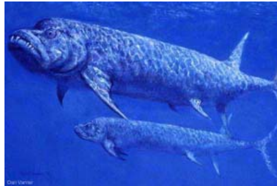
Xiphactinus swimming in the Late Cretaceous Pierre Sea. Painting by, and courtesy of, Dan Varner.

The tarpon-like fish, Xiphactinus , were among the largest fish that inhabited the Pierre Sea. They grew to lengths of 18 feet. Their large size, long bodies, powerful tails, and bulldog-like jaws suggest that they were efficient predators. Xiphactinus had large fangs at the front of the mouth probably used to strike or impale prey during the initial attack.