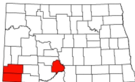
Locations where fossils have been found