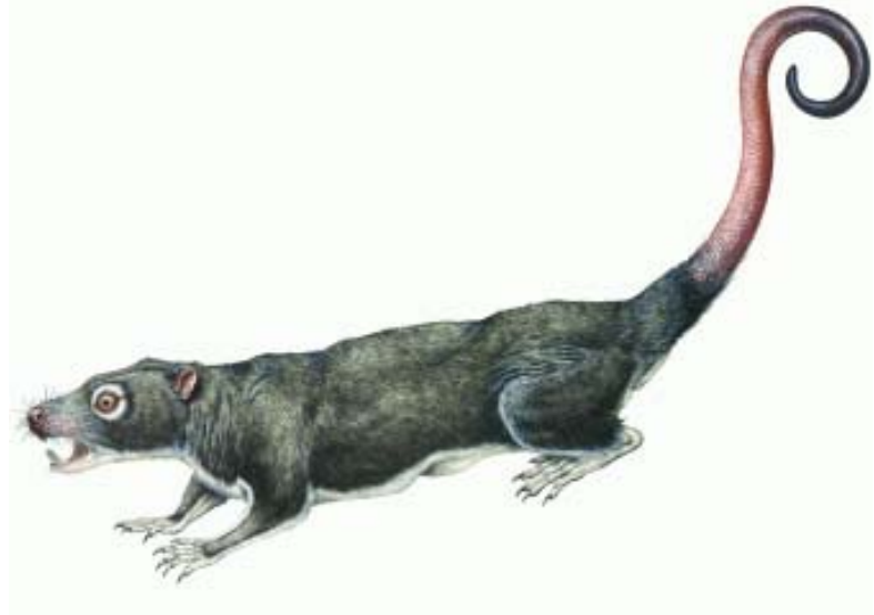
Ptilodus . Painting courtesy of Simon and Schuster Publishing Company.

Ptilodus is a member of the primitive mammalian group called multituberculates, the earliest of the plant-eating mammals. They were rodent like in appearance but not closely related to them. Ptilodus grew to lengths of about 20 inches. Like rodents, they had gnawing incisors and grinding premolar and molar teeth. Ptilodus had a prehensile tail that could be used for grasping branches. Its feet were also adapted for climbing, like a squirrel. They probably therefore lived in trees. Their large, bladlike lower premolar teeth suggest that they were able to remove the husks from nuts and seeds.