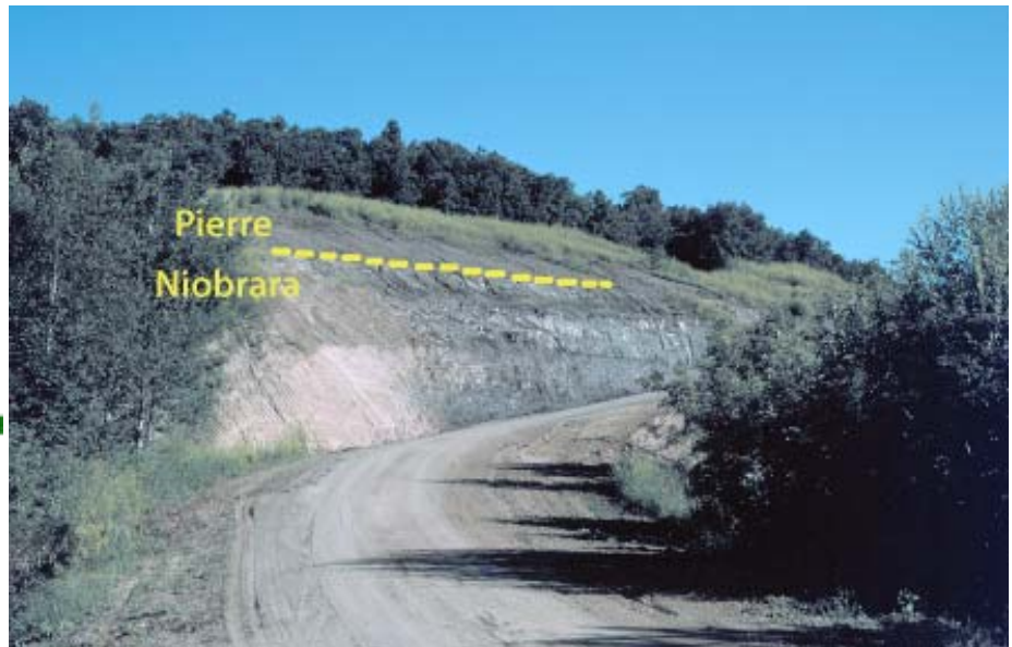
Outcrop near Wallhalla in Cavalier County showing the Niobrara Formation overlain by the Pierre Formation (Cretaceous). Outcrop is 20 m thick. View is to the northwest.

During the Cretaceous, from about 90 million to 65 million years ago, North Dakota was either completely or partially covered by subtropical to warm temperate, shallow epicontinental seas. These seas occupied what was called the Western Interior Seaway, essentially the North American mid-continent. The seas were never very deep, perhaps a few hundred feet at most, and at their greatest extent they connected the Arctic Ocean with the Gulf of Mexico. During low sea level, the Hell Creek Delta covered western North Dakota and Fox Hills Sea shoreline habitats occurred in central North Dakota. Fine grained sediments, mostly silt and clay, deposited on the floor of these oceans are now rocks of the Carlile, Niobrara, and Pierre Formations. These are the oldest rocks exposed in North Dakota. Entombed in these rocks are fossils of the animals and plants that inhabited the seas. Remains of marine reptiles, including the mosasaur Plioplatecarpus , plesiosaurs, and the sea turtle, Archelon ; fish (such as sharks, rays, and ratfish); birds; and invertebrates (including clams, cephalopods, snails, corals, and crabs) have been recovered from these rocks.