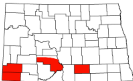
Locations where fossils have been found