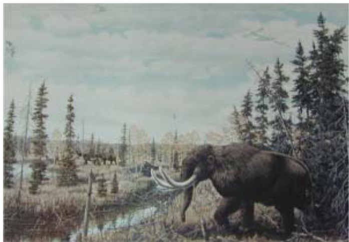
Painting of mastodons in a spruce forest. Much of North Dakota appearing like this about 11,000 years.

Description: The American mastodon, Mammut americanum , was one of the most common proboscideans that lived in North America at the end of the Ice Age, but few fossils of these animals have been found in North Dakota. Mastodons were elephant like and elephant size, about the size of the Indian elephant that lives today. Many were about 10 feet tall at the shoulder. The heads of these animals were long and held low, with long, curved tusks. Like the woolly mammoth that lived in North Dakota at the same time as mastodons, they were covered with long shaggy hair for insulation against the Ice Age cold. They were browsers and lived in spruce woodlands. Paleo-Indians hunted these animals. They became extinct at about the same time as woolly mammoths at the end of the Ice Age about 10,000 years ago.