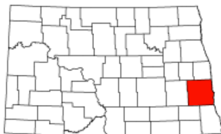
Locations where fossils have been found