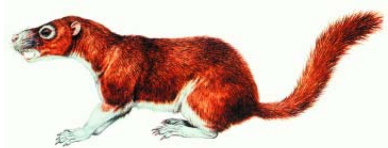
Ischyromys . Painting courtesy of Simon and Schuster Publishing Company.

Description: Ischyromys was one of the earliest of the true rodents. It was very similar in appearance to modern rodents and had a characteristic pair of upper incisors and other rodent head features. Ischyromys grew to lengths of 2 feet. It also possessed strong hind limbs with claws on each five toes of its hind feet, like modern rodents. It is believed that Ischyromys was an efficient tree climber like squirrels today.