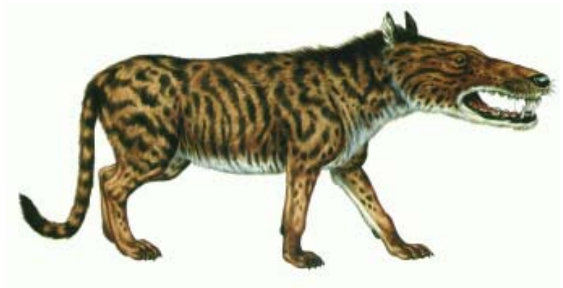
Hyaenodon . Painting courtesy of Simon and Schuster Publishing Company.

Description: Hyaenodon was one of the creodonts. Creodonts were the group of dominant flesh-eating mammals worldwide during the early Tertiary. Like the Order Carnivora, the posterior cheek teeth (called carnassials) of creodonts were modified to form specialized shearing surfaces for eating flesh. They also had huge heads compared to the size of their bodies. The creodonts became extinct in the Miocene. Hyaenodon lived in North Dakota about 30 million years ago. They were about 4 feet long. Their long legs suggest that they could run but probably not fast because of their spreading toes. Their strong canines, large premolars, and shearing carnassial teeth indicate that Hyaenodon was probably an active hunter and also a scavenger like the living hyena.