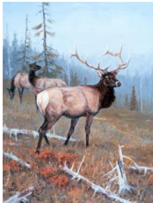
Elk ( Cervus ). Painting by, and courtesy of, Vern Erickson.

Description: Cervis elaphus , North America elk, lives in North Dakota today but was much more abundant in the past. Two hundred years ago, Lewis and Clark recorded huge herds of elk in North Dakota. They are large animals, the males are up to about 8 feet long and weight on average about 700 pounds. They can live in a variety of habitats including forests and badlands. They are both browsers and grazers. Elk fossils are not common in North Dakota but antlers have been found in Holocene sediments.