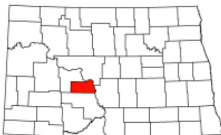
Locations where fossils have been found