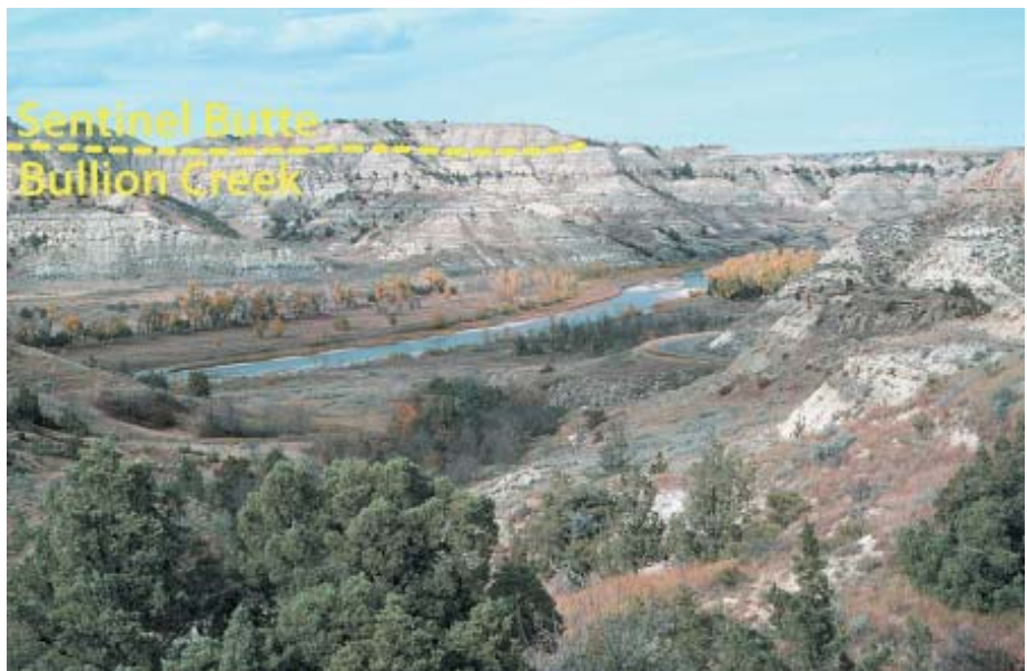
Outcrops of the Bullion Creek and Sentinel Butte Formations (Paleocene), Theodore Roosevelt National Park, South Unit, Billings County. Cottonwood campground is in the grove of trees along the Little Missouri River. View is to the northwest.

During the Paleocene, between about 65 million and 55 million years ago, sediments eroded from the rising Rocky Mountains were carried to western North Dakota and deposited in rivers, floodplains, lakes, and swamps. These lithified sediments are the Ludlow, Slope, Bullion Creek, Sentinel Butte, and Golden Valley Formations. Mats of vegetation built up in the swamps and the vegetation was eventually transformed into lignite coal. This subtropical, swampy lowland contained extensive forests and provided a habitats for exotic plants and animals. Invertebrates, including clams, snails, insects, and minute crustaceans, lived in the rivers, streams, ponds, and swamps. Many kinds of vertebrates also lived in and near these aquatic habitats including turtles, crocodiles, alligators, champsosaurs (crocodile-like reptiles), and fish. Exotic plants such as ferns, cycads, figs, bald cypress, Ginkgo , Magnolia , sycamore, giant dawn redwoods, and palm grew in the lush forests. Insects and birds lived on and ate these plants. Mammals were beginning to become established during this time after the extinction of the last of the dinosaurs a few million years earlier.