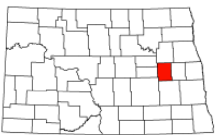
Locations where fossils have been found