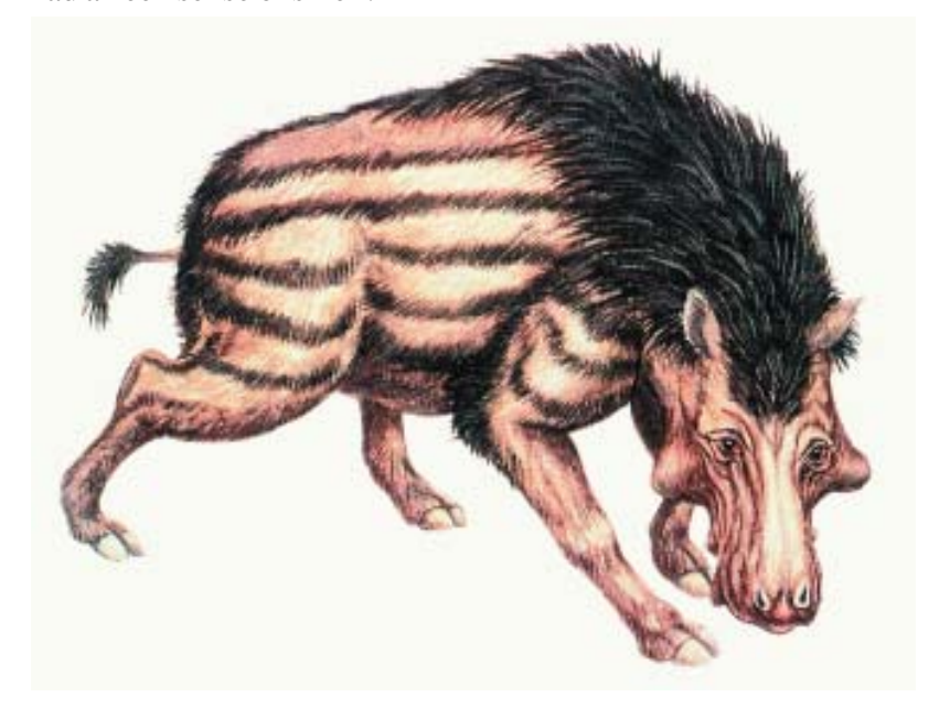
Archaeotherium. Painting courtesy of Simon and Schuster Publishing Company.

Archaeotherium was similar in appearance to the living warthog and grew to lengths of about 4 feet. It had an elongate skull with unusual protrusions of bone on the lower jaws beneath the eyes. These boney knobs probably provided anchors for the powerful jaw muscles. Archaeotherium mostly ate roots and tubers but with its powerful jaws and teeth could eat most anything, even carrion, like modern pigs. The strong shoulder and neck muscles suggest that these animals spent much of their time rooting and grubbing in the ground. Large olfactory lobes indicate that they had a keen sense of smell.