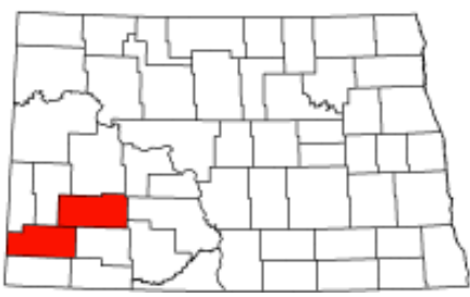
Locations where fossils have been found