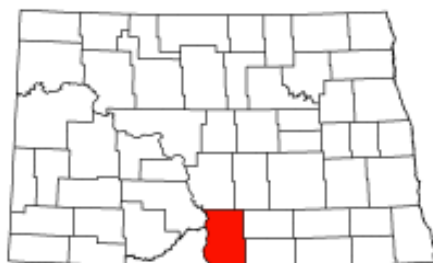
Locations where fossils have been found

Amebelodon . Painting courtesy of Simon and Schuster Publishing Company.