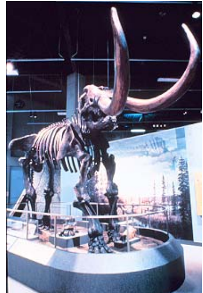
Figure 4. The Highgate Mastodon.

December, 1991). The skull of the giant Ice Age bison, Bison latifrons , with a horn span of seven feet, is also in that exhibit (Figure 5) (see my NDGS Newsletter article, v. 29, no. 2). A beautifully preserved wolf-dog skeleton recovered from a 2,300 year old archeological site is also on display.