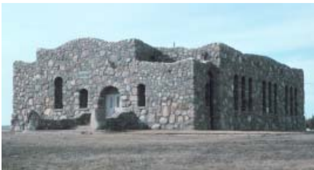
Figure 19. Broste Rock Museum, Parshall.

The museum was closed for many years after Broste's death but was reopened by the City of Parshall in 1998 (see my NDGS Newsletter article v. 25, no. 3, 1998). Prior to reopening, I spent several days identifying rocks, minerals, and fossils in the collection and evaluating the collection for the museum officials. We organized the collection and provided display labels for the specimens. Although there are relatively few fossils in the museum, thousands of beautiful, rare, mineral and rock specimens from around the world are displayed.