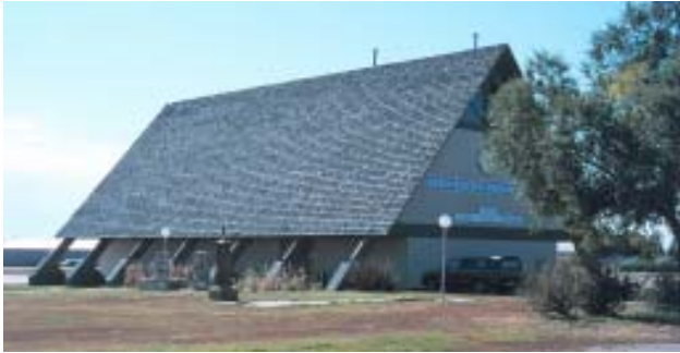
Figure 18. Three Affiliated Tribes Museum, New Town.

A cast of the skull of the giant Ice Age bison, Bison latifrons , is on permanent exhibit at the Three Affiliated Tribes Museum in New Town (Figure 1.12; Figure 18). The original skull was found along the shore of Lake Sakakawea near New Town on U. S. Army Corps of Engineers administered land within the Fort Berthold Reservation. That skull is on exhibit at the Heritage Center in Bismarck.