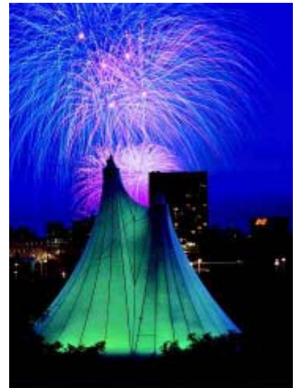
Figure 25. Heritage Hjemkomst Interpretive Center, Moorhead, Minnesota.

Although the Heritage Hjemkomst Interpretive Center (Figure 1.18; Figure 25) in Moorhead, Minnesota is a history museum they have, on occasion brought robotic dinosaur exhibits into the interpretive center to raise funds. On those occasions, the NDGS has provided dinosaur fossils collected from western North Dakota and in the North Dakota State Fossil Collection to accompany the animated robotic dinosaur models.