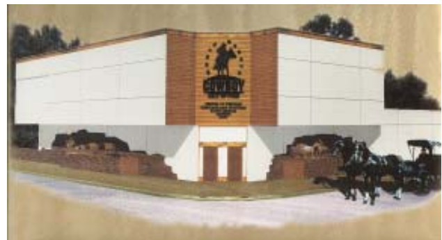
Figure 12. The North Dakota Cowboy Hall of Fame.

The NDGS is currently working with the North Dakota Cowboy Hall of Fame in Medora (Figure 1.8; Figure 12) to develop an evolution of the horse exhibit. A skeleton (cast) and actual fossils of the three-toed horse, Mesohippus , will be featured in this exhibit (Figure 13). The diminutive (adults were only about 18 inches tall) Mesohippus roamed western North Dakota about 30 million years ago. The North Dakota Cowboy Hall of Fame will officially open in 2005.