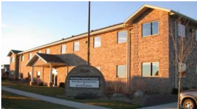
Figure 6. NDGS and Oil & Gas Division office building, Bismarck.

In 2001, the North Dakota Geological Survey and Oil and Gas Division of the Industrial Commission moved into a new office building in Bismarck (Figure 1.2; Figure 6). A foyer outside the receptionist's office contains geological and paleontological displays. Visitors are greeted by the 65 million year old skull of the three-horned dinosaur, Triceratops , recovered from U. S. Forest Service-Dakota Prairie Grasslands administered land in the Little Missouri National Grassland, Slope County (Figure 7). Other North Dakota fossils in the foyer exhibit area are: jaws and skulls of 30 million year old horses, rhinoceroses, oreodonts, and other mammals; a 35 million year old fish skeleton; a claw from an Ice Age ground sloth; and a woolly mammoth tooth; 75 million year old shark, ray, and other fish teeth and crabs, clams, and snails from the same age; and a variety of 60 million year old leaf fossils.