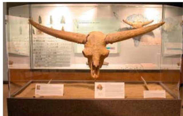
Figure 5. Skull of Bison latifrons .