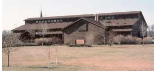
Figure 28. Icelandic State Park Pioneer Heritage Center, Cavalier.

animals including a giant squid. Several of these fossils are exhibited at the Icelandic State Park Pioneer Heritage Center in Cavalier (Figure 1.20; Figure 28) and at the Cavalier County Museum in Dresden, a former Catholic church constructed of field stones (glacial erratics)(Figure 1.19; Figure 29).