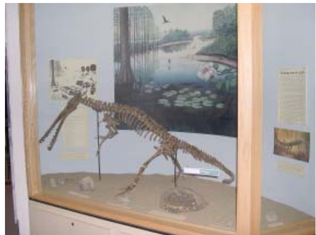
Figure 11. Skeleton of Champsosaurus.