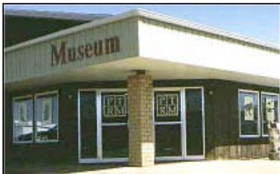
Figure 9. The Pioneer Trails Regional Museum, Bowman.

The North Dakota Geological Survey has had the pleasure of working with the Pioneer Trails Museum in Bowman (Figure 1.6; Figure 9) since the museum's inception, in their efforts to develop fossil collections and exhibits. The well presented fossil exhibits in the museum have been created by the museum staff with little involvement, other than encouragement, from the NDGS. The exhibit includes the remains of several kinds of dinosaurs including Triceratops , Tyrannosaurus rex , and duckbilled dinosaurs recovered from the Hell Creek Formation near Marmarth. A variety of other vertebrate and leaf fossils from the Hell Creek Formation are also displayed. The museum also features a variety of mammal fossils, mostly skulls, including oreodonts, giant pigs, insectivores and others collected from 30 million year old rocks exposed in Slope County.