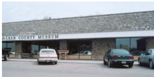
Figure 21. McLean County Museum, Washburn.

A geology exhibit, consisting of rocks, minerals, and fossils mostly found in the Washburn area, is just inside the entrance to the McLean County Museum in Washburn (Figure 1.15; Figure 21). Museum officials contacted me in 2002 to help them evaluate, organize, and renovate this exhibit (Figure 22).