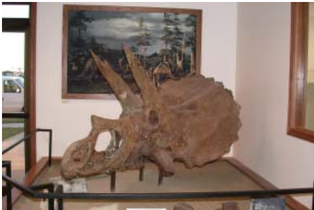
Figure 7. Triceratops skull.