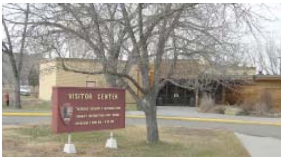
Figure 10. Theodore Roosevelt National Park visitors center, Medora.

In 1997, we conducted a paleontological inventory of Theodore Roosevelt National Park. During that study several important and well preserved fossils were recovered from 60 million year old rocks exposed in the park (see my NDGS Newsletter article, Spring 1997). Several of these fossils are on exhibit in the Theodore Roosevelt National Park visitors' center museum in Medora (Figure 1.7; Figure 10). The display includes a restored skeleton of a crocodile-like animal called Champsosaurus (Figure 11), the shell of the snapping turtle, Protochelydra with crocodile bite marks, crocodile and fish remains, freshwater snail and clam shells, and a leaf fossil.