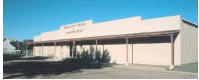
Figure 24. Griggs County Museum, Cooperstown.

200 feet from the location where the Plioplatecarpus skeleton was excavated. A cast of part of the lower jaw of that turtle is on display in the Griggs County Museum (see NDGS Newsletter article, this issue).