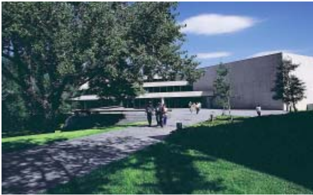
Figure 2. North Dakota Heritage Center, Bismarck.

For the past 14 years, the NDGS and State Historical Society of North Dakota have been working toward completion of a series of fossil exhibits in the North Dakota Heritage Center that trace the history of life in North Dakota from about 90 million years ago to the present (Figure 1.1; Figure 2). The space within the Heritage Center that is devoted to these fossil exhibits is called the "Corridor of Time." These exhibits are meant to provide a prehistoric background and setting for the appearance of humans in North Dakota, which occurred about 11,000 years ago. The remainder of the Heritage Center is devoted to interpretation of the human history of the state.