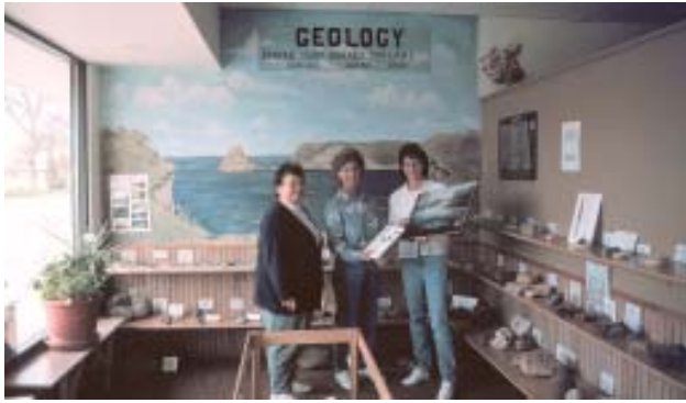
Figure 22. Geology exhibit in the McLean County Museum.