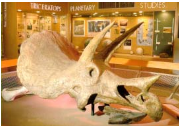
Figure 27. Triceratops skull in Leonard Hall.