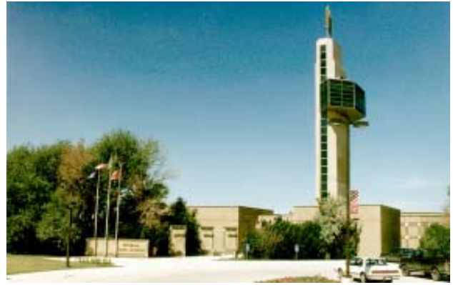
Figure 31. State Museum, Pembina.

The mission of the Pembina State Museum in Pembina (Figure 1.21; Figure 31) is to interpret the history and prehistory of the northeastern part of North Dakota. The Pierre Sea covered that part of the state 80 million years ago and fossils of creatures that lived in that sea including the skull (cast) of the marine lizard, Platecarpus ; shark teeth; teeth and bones of other fish such as the salmon-like Enchodus ; bones of the flightless sea bird, Hesperornis ; and fossils of invertebrate animals (snails, clams, and crabs) are exhibited. A tooth of a woolly mammoth, Mammuthus , is also displayed in the museum.