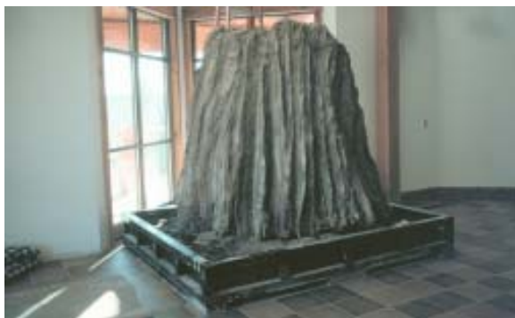
Figure 15. 60 million year old petrified tree stump.