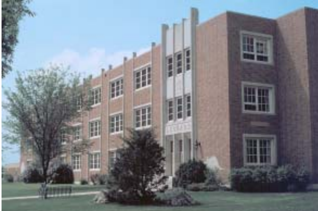
Figure 26. Leonard Hall, UND Campus, Grand Forks.

one of the most complete skulls ever found of Triceratops , the three-horned dinosaur (Figure 27); several fossil fishes from Wyoming; 60 million year old leaf fossils collected by Clarence Johnsrud from a site near Trenton; a Sentinel Butte Formation rock slab containing bird fossil tracks; and an exhibit of miscellaneous fossils from North Dakota.