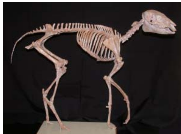
Figure 13. Skeleton cast of the 3-toed horse Mesohippus .