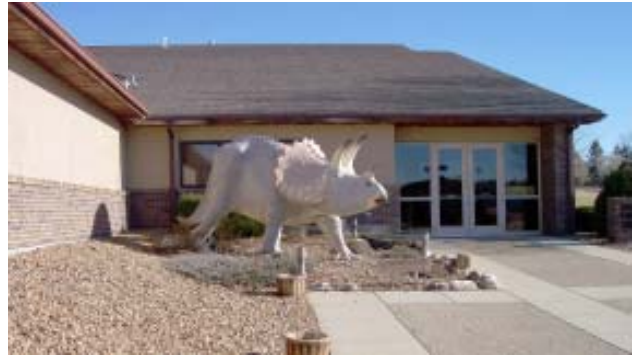
Figure 8. Dakota Dinosaur Museum, Dickinson.

Triceratops . This is one of the most complete Triceratops skeletons ever found. The Dakota Dinosaur Museum features full scale models of several of the well known dinosaurs.