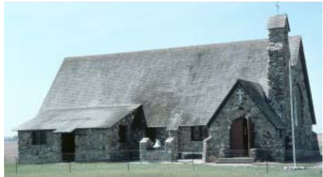
Figure 29. Cavalier County Museum, Dresden.