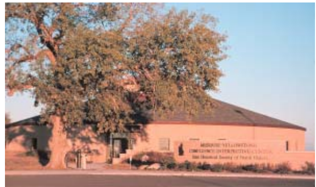
Figure 16. Missouri-Yellowstone Confluence Interpretive Center, Buford.

The interpretive center also contains a petroleum industry exhibit. This exhibit features a core from the first discovery well in North Dakota, the Clarence Inverson #1 well near Tioga. Examples of different varieties of North Dakota crude oil, and different types of drill bits used in exploration for oil and gas, are also displayed.