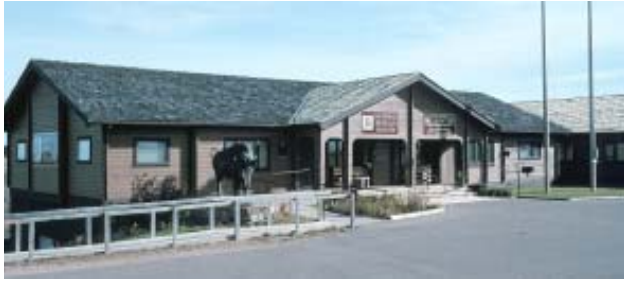
Figure 23. National Buffalo Museum, Jamestown.

A cast of the skull of the huge Ice Age bison, Bison latifrons , that was discovered along the shore of Lake Sakakawea is displayed in the National Buffalo Museum in Jamestown (Figure 1.16; Figure 23). The original skull is exhibited in the Heritage Center in Bismarck.