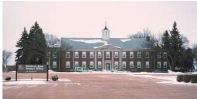
Figure 20. The U.S. Army Corps of Engineers Headquarters, Riverdale.