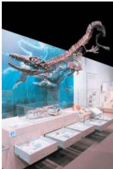
Figure 3. Plioplatecarpus .

The following exhibits have been completed in the "Corridor of Time." Suspended from the ceiling is the 23 foot long skeleton of a mosasaur called Plioplatecarpus (Figure 3). This marine lizard lived in the Pierre Sea that covered North Dakota during the Cretaceous about 75 million years ago (see my NDGS Newsletter articles, v. 23, no. 2&3, 1996; Winter, 2000). This fossil was found in Griggs County and a cast of its skull is on exhibit in the Griggs County Museum, Cooperstown. The "Corridor of Time" Cretaceous marine exhibit also includes the remains of the flightless sea bird, Hesperornis , sharks, rays, other fish, crabs, snails, clams, and cephalopods.