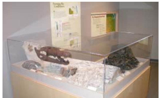
Figure 17. Fossils in the Missouri-Yellowstone Confluence Interpretive Center (Photo by Genia Hesser).