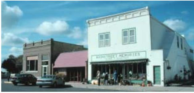
Figure 30. The Walhalla Museum of Natural History, Walhalla.