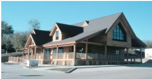
Figure 14. Long X Visitor Center, Watford City.

The Long X Visitor Center is scheduled to open in 2004.