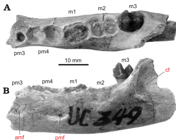
Fig. 2. Right mandible of the cimolestan mammal gen. et sp. indet. (FMNH UC 349) from the White River Badlands of South Dakota, in dorsal (A) and buccal (B) views. {please explain abbreviations: pmf, amf, cf}

The crown of m3 is rectangular in occlusal view (Fig. 2A, B). The trigonid is anteroposteriorly compressed. The paraconid is small, low, positioned along the midline of the tooth and is connected to the protoconid by a thin crest. The protoconid is triangular and is the tallest cusp of the crown. The metaconid is only slightly smaller in height and size. The anterolingual position of the paraconid gives the trigonid basin a closed appearance. There is a well-developed anterior cingulid, which extends from the base of the metaconid to the base of the protoconid. The anterior cingulid is highest in elevation below the paraconid, with the widest portion of the cingulid being located on the anterobuccal corner of the tooth. The buccolingual width of the trigonid is greater than that of the talonid. The hypoconid, the largest talonid cusp, is positioned on the posterobuccal corner of the tooth, and is conical with a small hypostylid on the anterior margin. A small accessory cuspule is present between the hypostylid and the trigonid wall. The presence of the three cusps gives the cristid obliqua, which attaches to the posterior face of the protoconid, an irregular appearance. The entoconid is incorporated into an elongate ridge on the posterolingual corner of the tooth, with its apex forming the highest point of the ridge. This ridge has an irregular occlusal surface and continues around the posterolingual corner of the tooth, ending near the